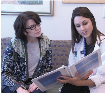
Critical Care Healing Journal INNOVATION 2018