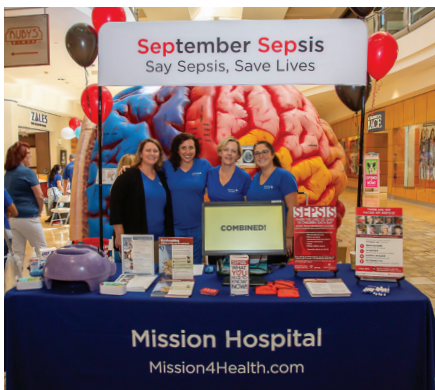
Sepsis Team QUALITY 2018