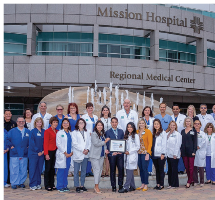
Comprehensive Stroke Team COLLABORATIVE PRACTICE 2018