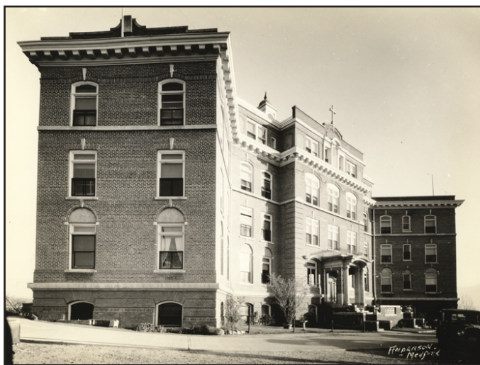
Sacred Heart Hospital now known as Providence Medford Medical Center, Medford, Ore., circa 1939 (Image #120.A2.1)

☞ Providence Elizabeth House, Seattle, Wash.