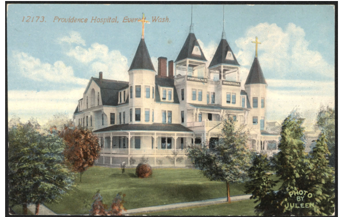
The former Monte Cristo Hotel was the home of Providence Hospital, Everett, from 1905 to 1924.