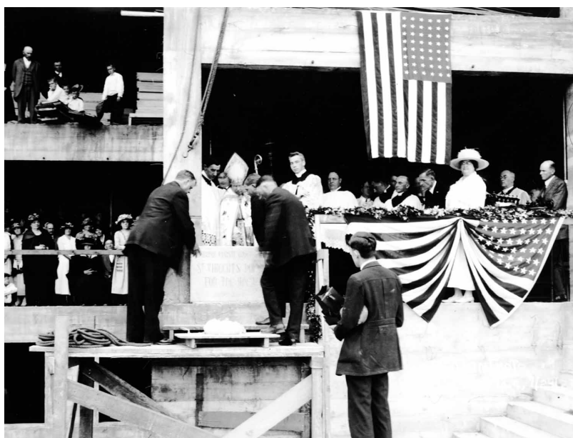
Cornerstone installation at St. Vincent Home for the Aged, now Providence Mount St. Vincent, in West Seattle, July 29, 1923