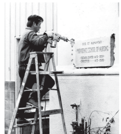
Removing cornerstone for the School of Nursing at Providence Oakland prior to demolition (1975)

is represented by the cornerstone from Providence