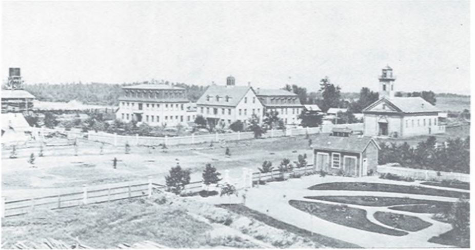
Indian Girls' School and Parterre in front of Boys' School., St. Ignatius Mission.