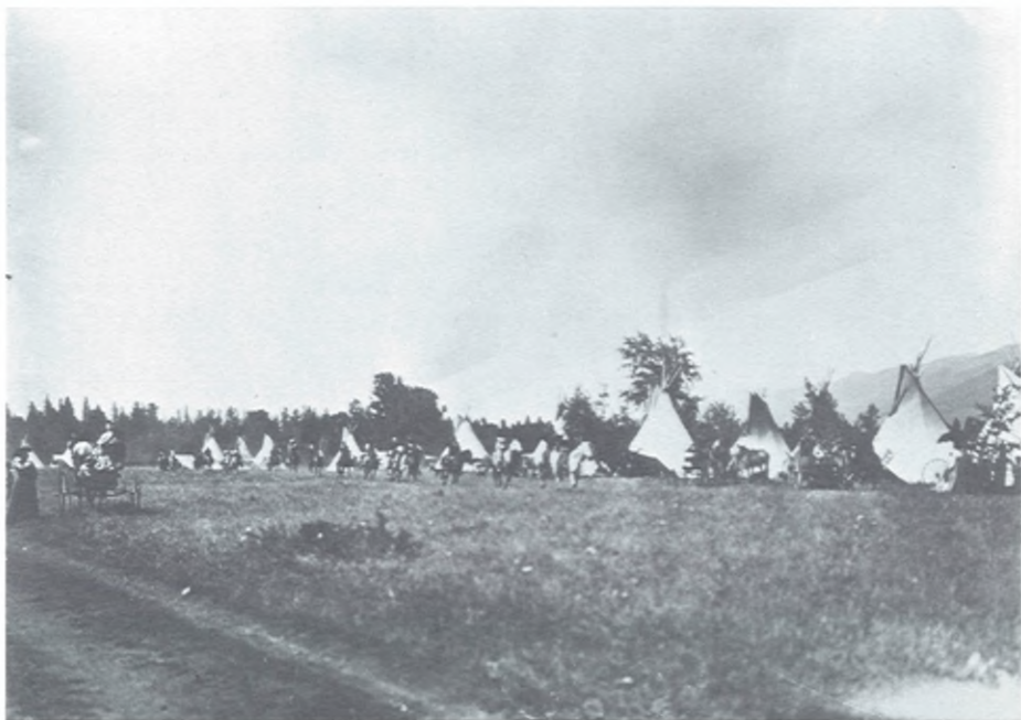
Encampment at St. Ignatius for church holy days — 1910

Father DeSmet in St. Louis was called on by the Government to act as peacemaker among the tribes. Between 1850 and 1860, he traveled from the east to the west coast, a chaplain to General William Harney. He interviewed top government officials in Washington, D.C., including President Lincoln who listened sympathetically to the problems of the Indians. However, the Civil War was the center of government attention at this time.