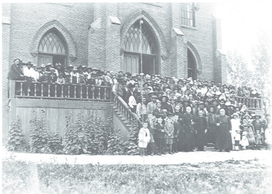
After Sunday Mass in 1917 at St. Ignatius Mission