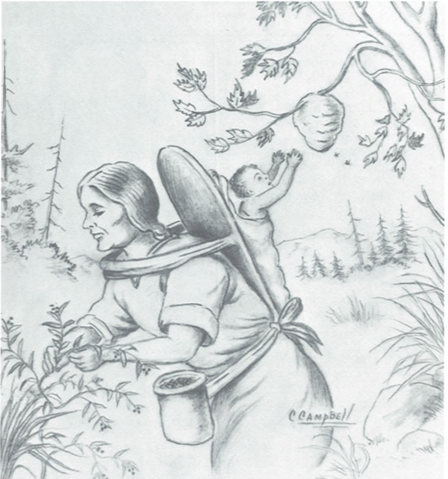
Picking huckleberries in the mountains Sketch by Clarence Campbell

They baked the camas in a pit on hot rocks. They put the camas in sacks and covered them with wet skunk-cabbage leaves and let them bake. They put fire on top of the leaves also and let the camas bake three or four days. Even in the fall we would eat the camas without baking. When it was baked, it was better. It was sweet. We kept it for winter food. Then we’d boil it, or the women would sometimes put