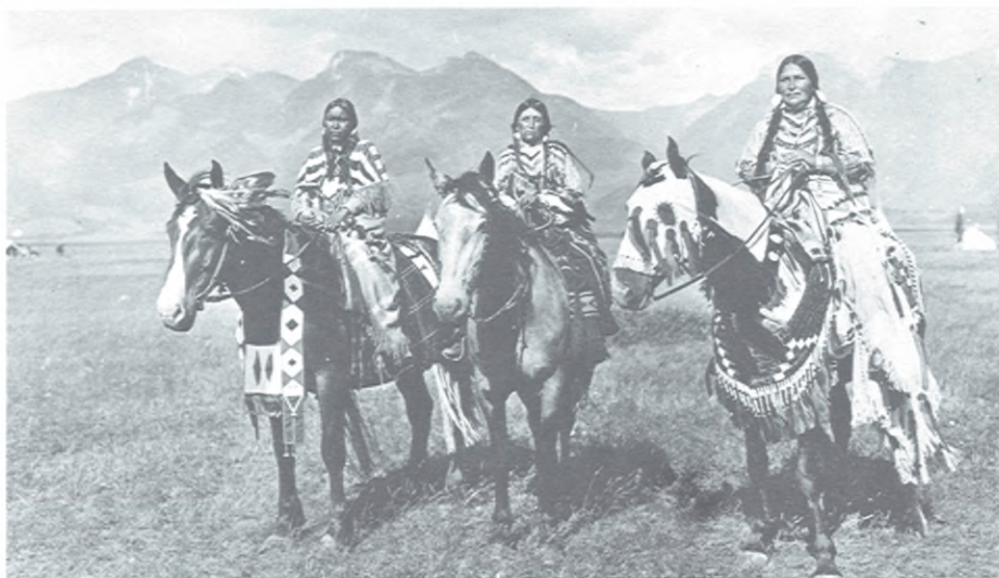
1910 — Some pupils of Holy Family School