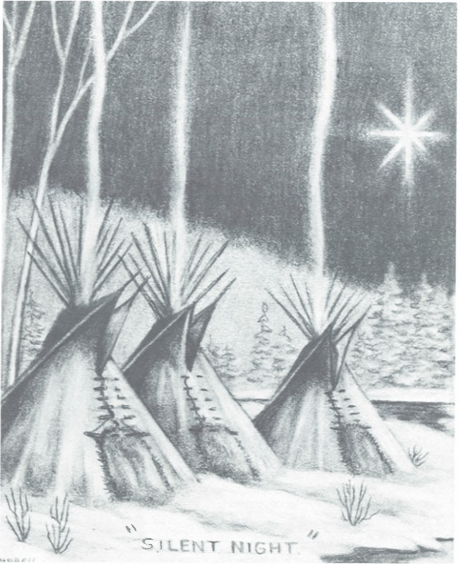
Teepees of the Mountain Tribes Sketch by Clarence Campbell