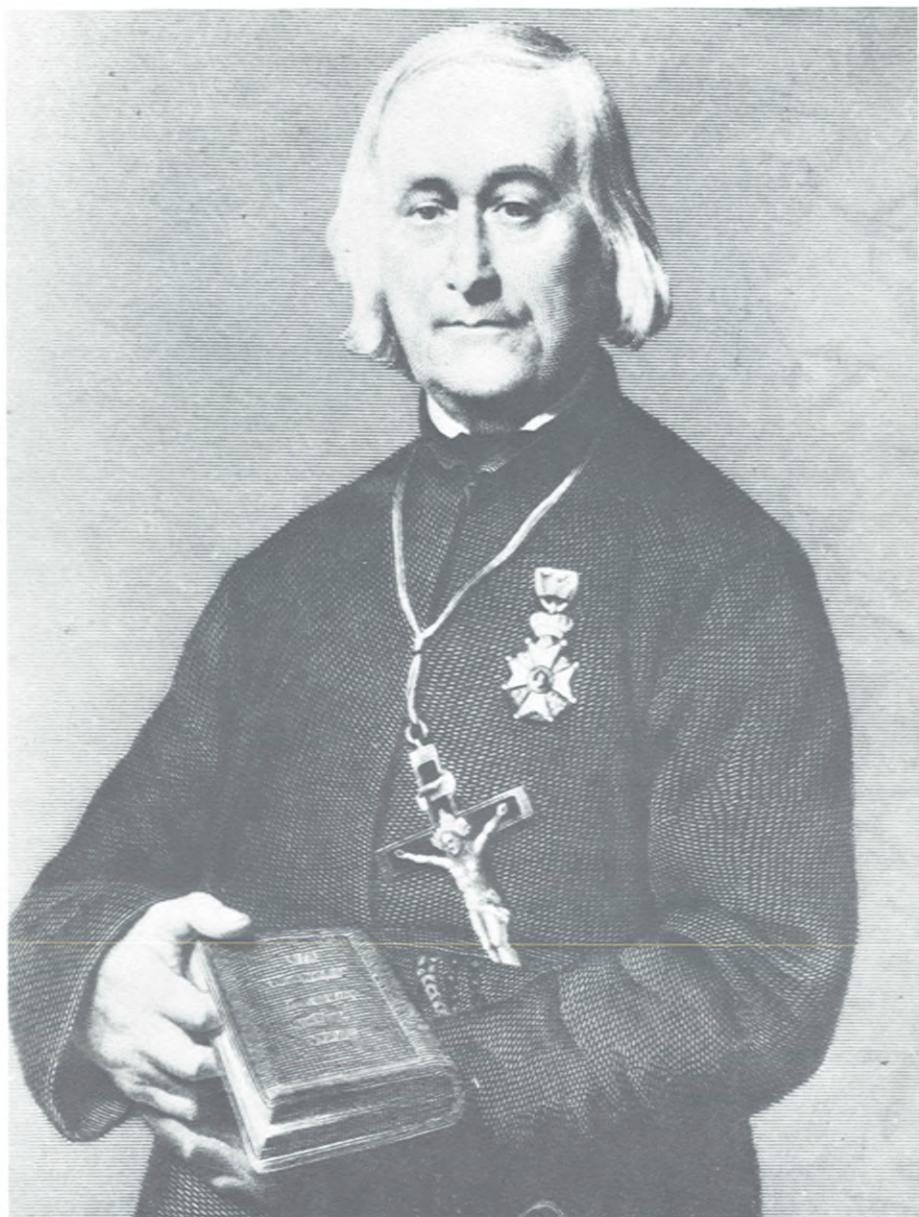
The first Black Robe to meet the mountain tribes, Father Pierre Jean DeSmet, S.J., in 1840.