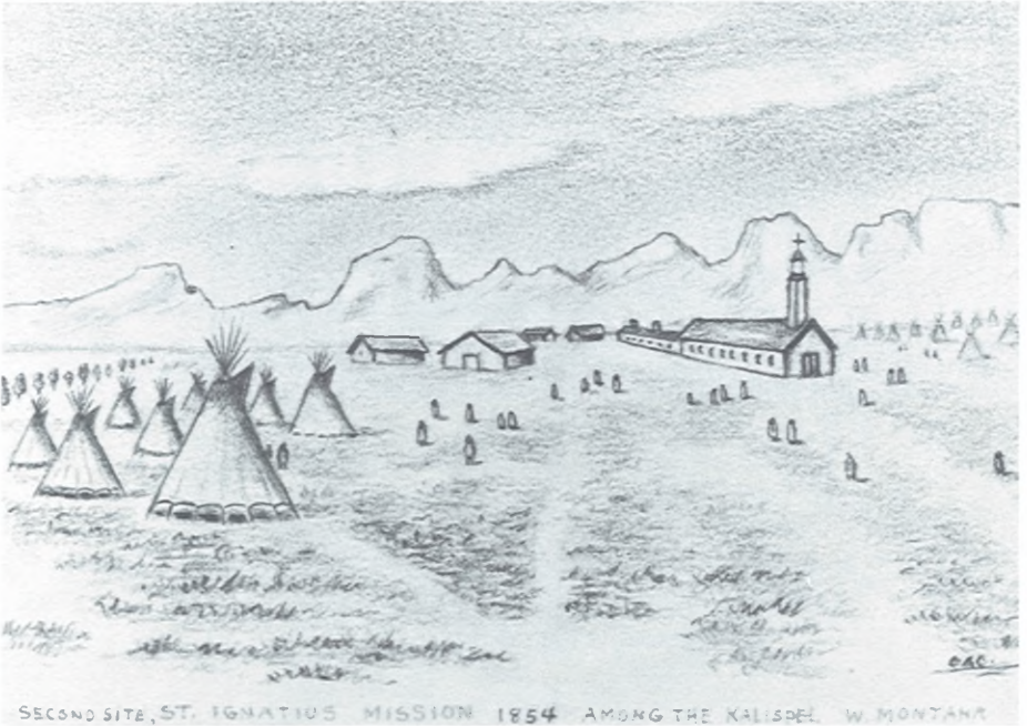
St. Ignatius Mission 1854