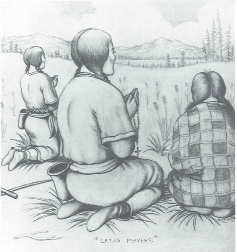
Kalispel women offer harvest prayers Sketch by Clarence Campbell