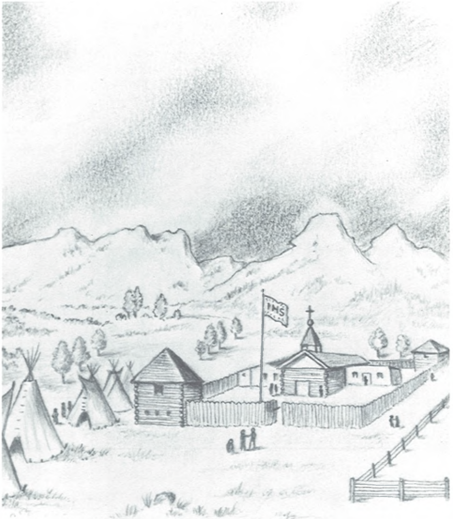
ST. MARY'S MISSION-1841-FLATHEAD INDIANS, MONTANA