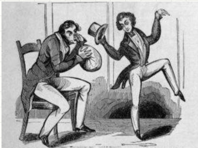
EXHIBITION OF THE LAUGHING GAS.

The Nitrous Oxide, or Laughing Gas, was discovered by Dr. Priestly, who produced it by abstracting a part of the Oxygen from the Nitric Oxide. It is composed of equivalent parts of Oxygen and Nitrogen. Before the time of Sir Humphry Davy, it was considered irrespirable; but by some very interesting experiments, he proved this opinion to be incorrect; he also wrote a work, entitled, "Researches on the Nitrous Oxide." It is named Laughing Gas on account of the very exhilarating sensations produced in those who respire it for a short time: laughing, dancing, jumping, acting, reciting, and (last but not least) fighting are amongst the prominent effects displayed by persons under its influence. The Febrile